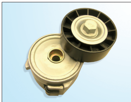
Fig. 1: Plastic Pulley

OE-No.: 500346227 (Plastic) 504106749 (Metal)