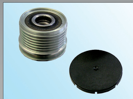
Fig. 2: Overrunning Alternator Pulley RUVILLE 55627

Adhere to the manufacturer's specifications at all times! A failure in the alternator belt pulley could interfere with the primary drive belt and cause expensive engine damage.