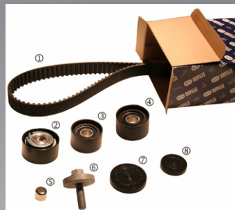
Figure 2: Contents of kit 555571

The correct positions of the individual components are displayed in figure 1. Deflection pulley 55587 with the grooved race is always found on the side of the tensioner pulley in the engines specified.