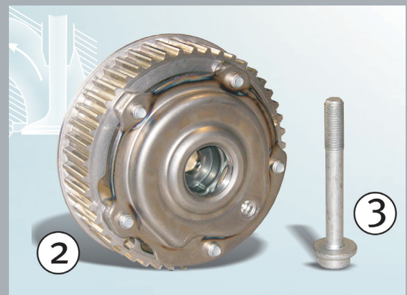
Image 2: Camshaft phasing unit for the intake side 205303 and central bolt 41301*