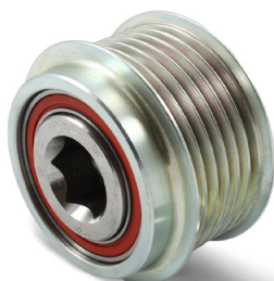
Figure 1: Previous design

During the transition period, we may have mixed stocks of both types.