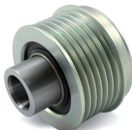
Figure 4: New design