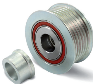
Figure 3: Previous design