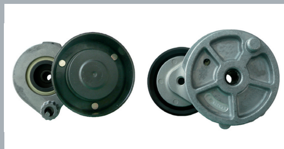
Figure 1: Previous design

During the transition period, we may have mixed stocks of both types.